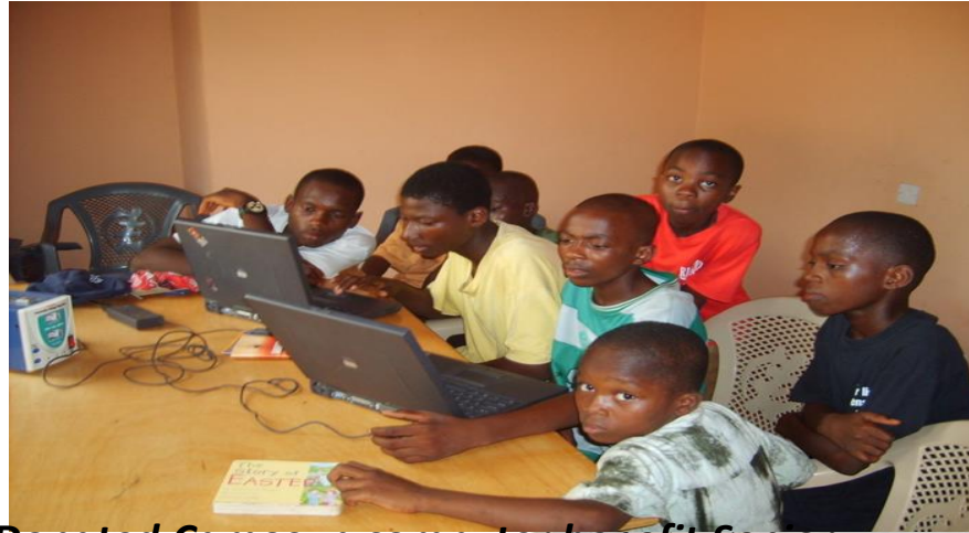
Donated Camosun computer benefit Senior High students in Nkoranza, Ghana